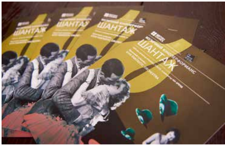
Envision Sound, Hitchcock's Blackmail original score event in Ukraine