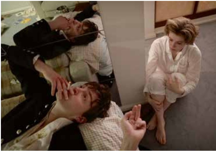
The Souvenir , Director Joanna Hogg - Official Selection at both Sundance Film Festival and Berlin Film Festival in 2019