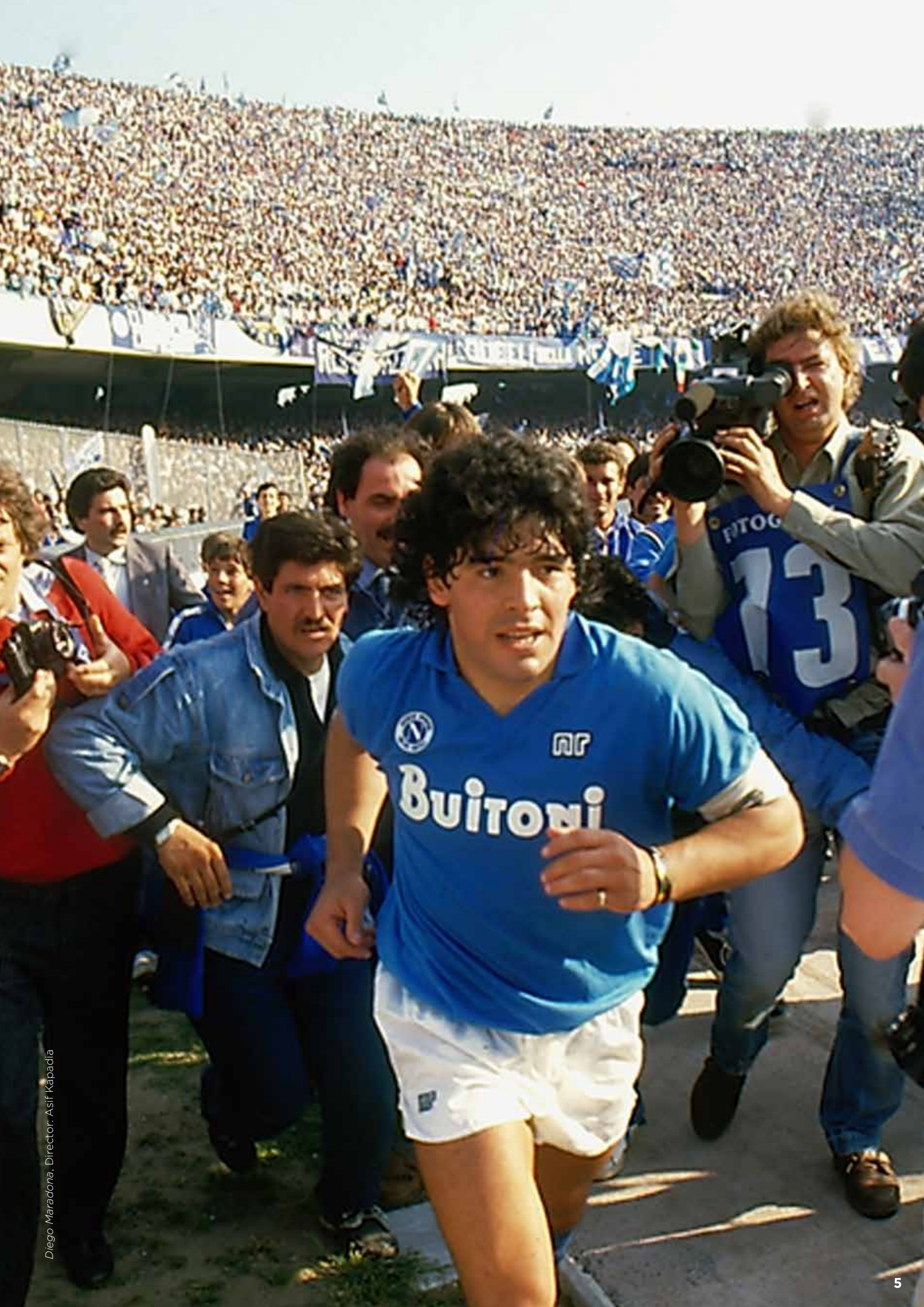
Diego Maradona, Director: Asif Kapadia